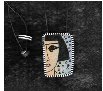
Karen Omodt's transfer example made into a pendant.